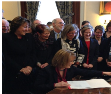
Gov. Hassan Signing Health Protection Program Bill

The most important compromise was the passage of the New Hampshire Health Protection Program. This bipartisan bill provides a path to private insurance coverage for over 50,000 low-income citizens. I worked hard to support these basic principles: expand health insurance for people with jobs by helping them afford their employer's plan; expand coverage to people and families under 138% of the Federal poverty level through private insurance; personal responsibility; and no cost to the New Hampshire taxpayer. I also supported the necessary expansion of insurance providers to create a competitive marketplace and to create networks to include all New Hampshire hospitals. New Hampshire will be a healthier state, and individuals and families will no longer face discrimination for preexisting conditions, lifetime cost limits, or going without needed medical care.